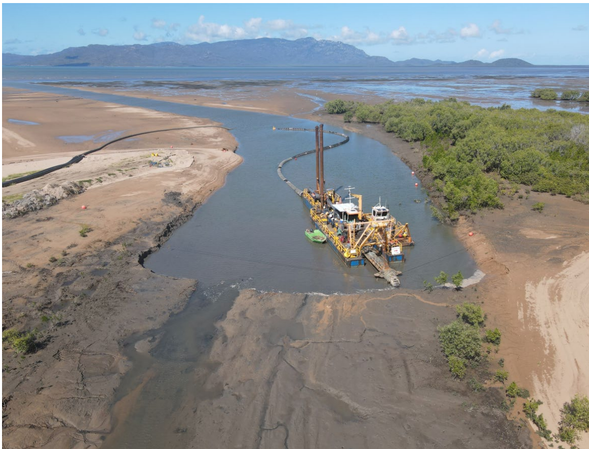
Molongle Creek dredging