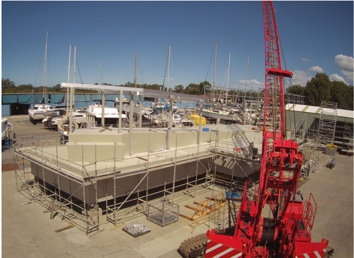
Construction of pontoon and commencement of the roof structure installation on the Russell Island pontoon.