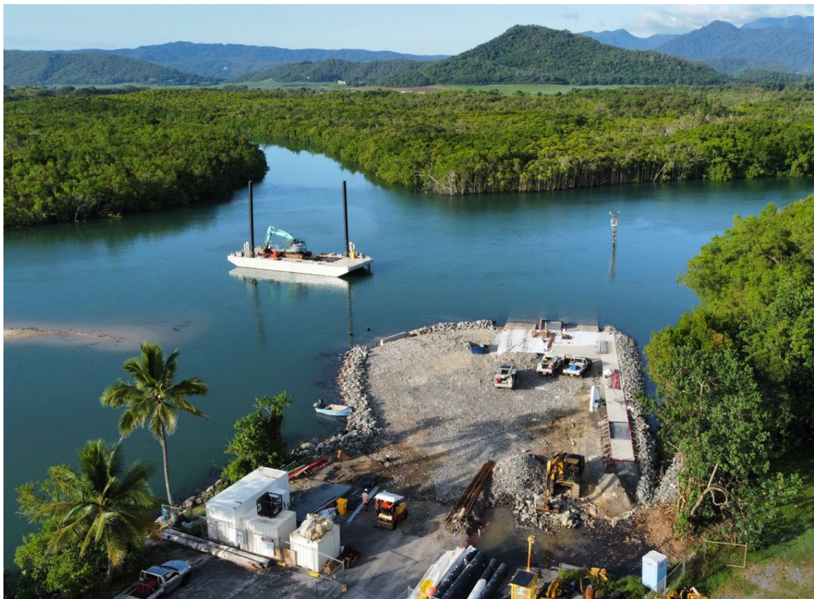
Newell Beach upgrade of boat ramp progressing.