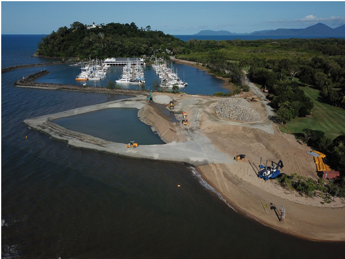
Yorkeys Knob landside works commenced with the reclamation for the harbour, boat ramps and car parks taking shape.